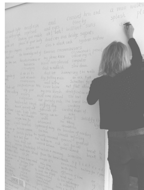
seekers of lice, I Am Not A Poet, Edinburgh 2011.