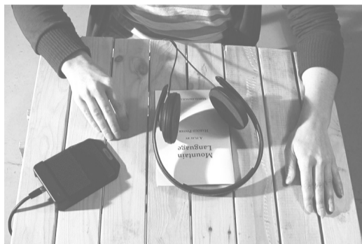
Lawrence Abu Hamdan, Mountain Language . Image courtesy the artist

Lawrence Abu Hamdan (UK): Mountain Language / Aural Archive Highlighting how language can be manipulated, oppressed or promoted for political and social gain, Abu Hamdan stages an audio adaptation of the Pinter play Mountain Language alongside a sound installation activated by the performic act of speaking.