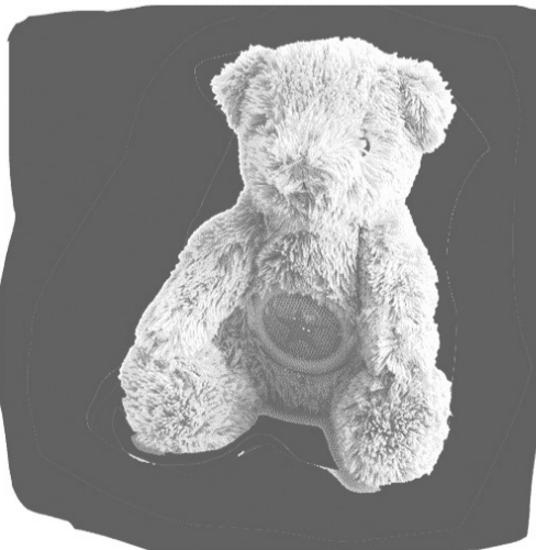
Holly Pester, Sooth the Saying of Sooth .

A looping sound poem about prophesying voices and public speech exchange situated in Arnolfini's foyer for the duration of 4 Days.