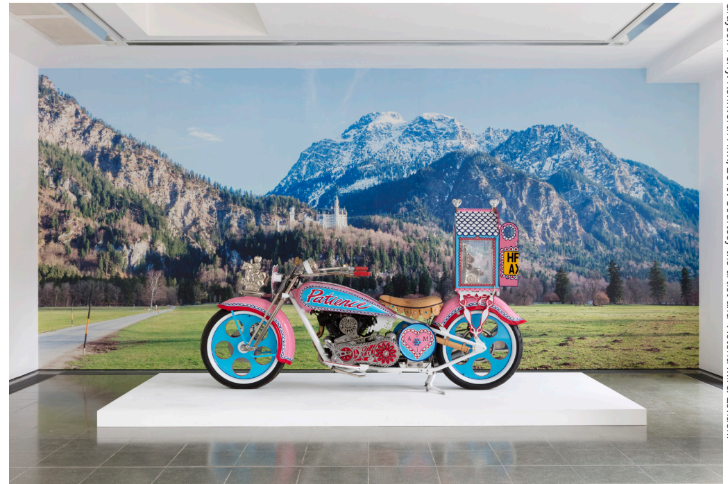
Grayson Perry, Kenworth AM1, 2010.