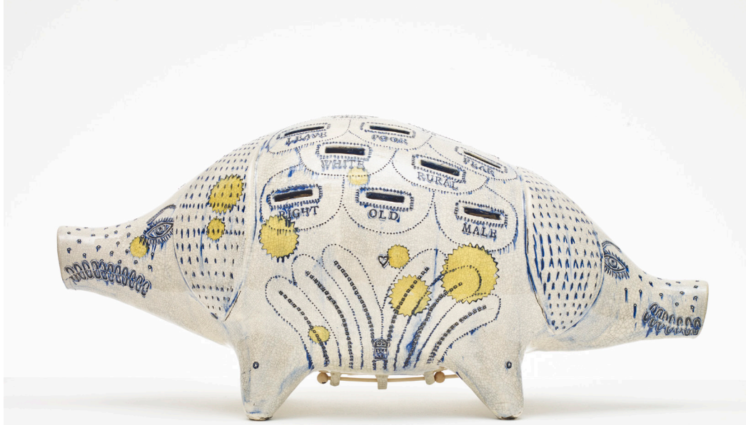
Grayson Perry. Long Pig, 2017. Glazed Ceramic. Courtesy the artist and Victoria Miro, London.

How many different slots are there on the piggybank? Grayson Perry is asking us a question with the piggybank. He wants to know what kind of person you think you are. Which slot would you put money in?